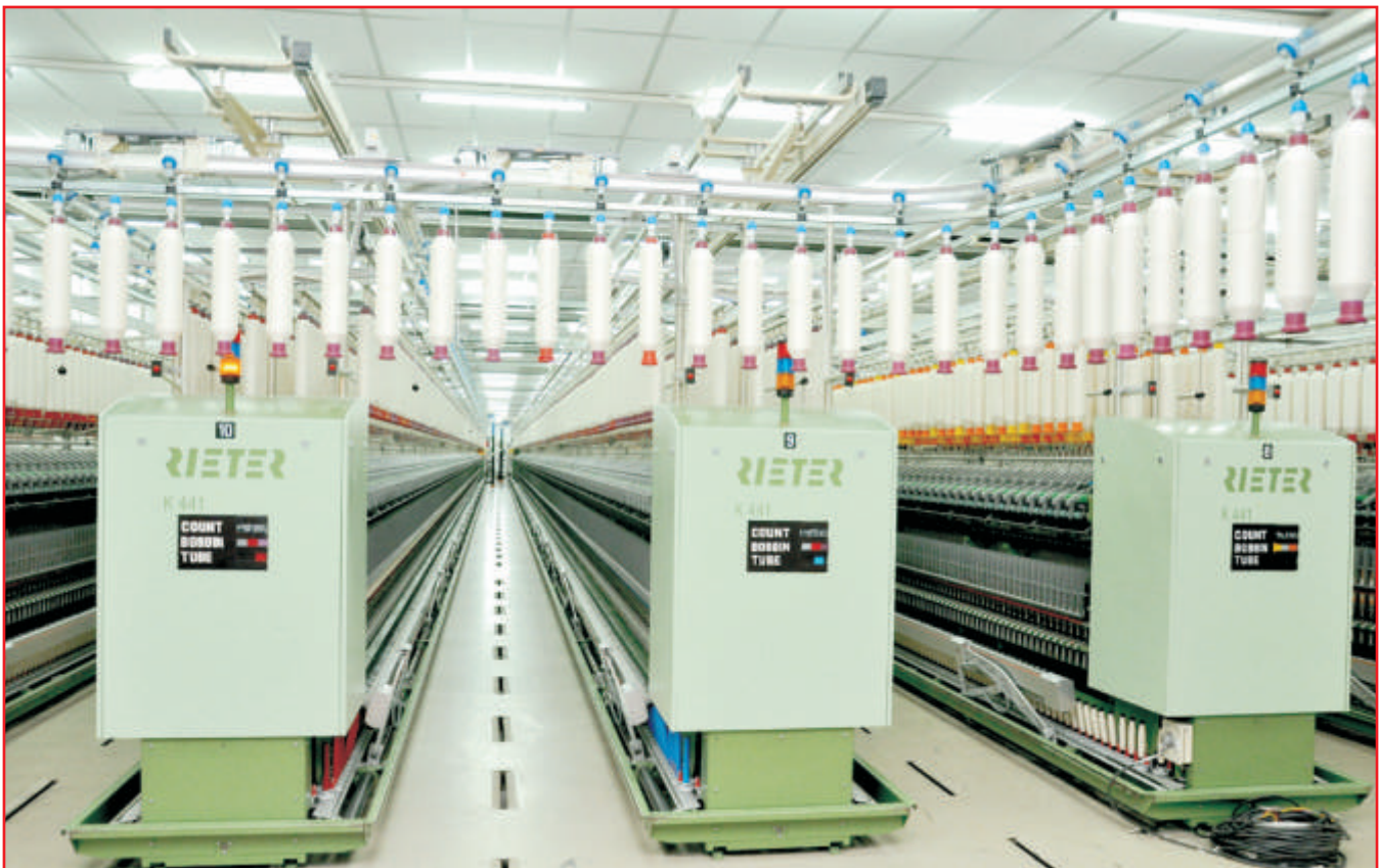
A view of the Comber Machine Model Rieter K 441 installed at our Textile Division, Sri Ramco Spinners, Rajapalayam.