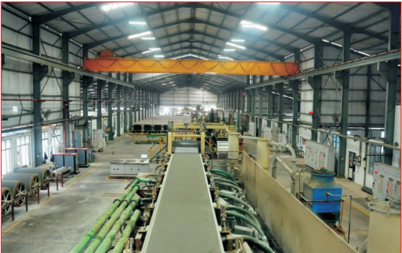
A view of the Fibre Cement Sheet Plant at Mathugama, Sri Lanka