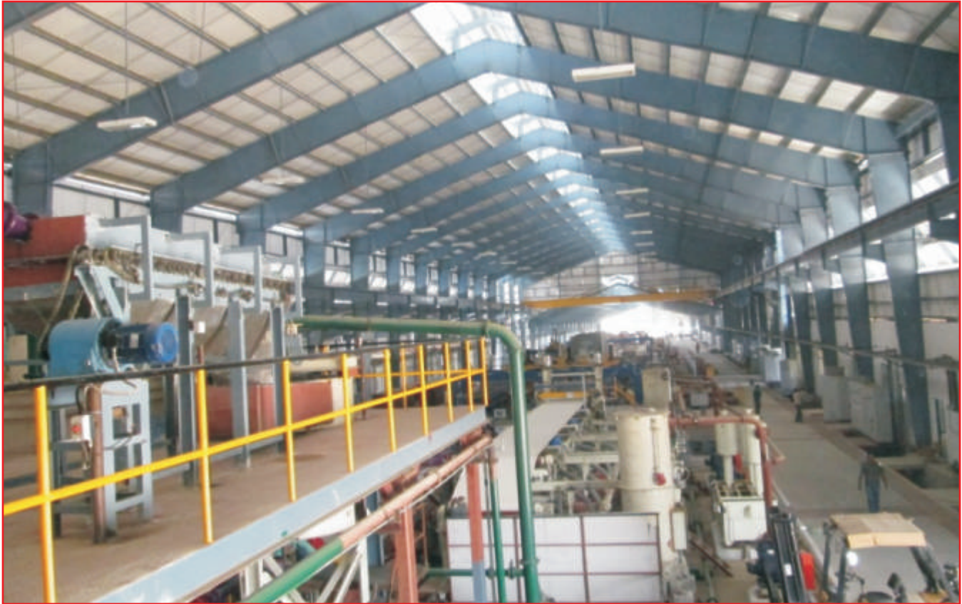
A view of the Calcium Silicate Board Plant at Kotputli, Rajasthan