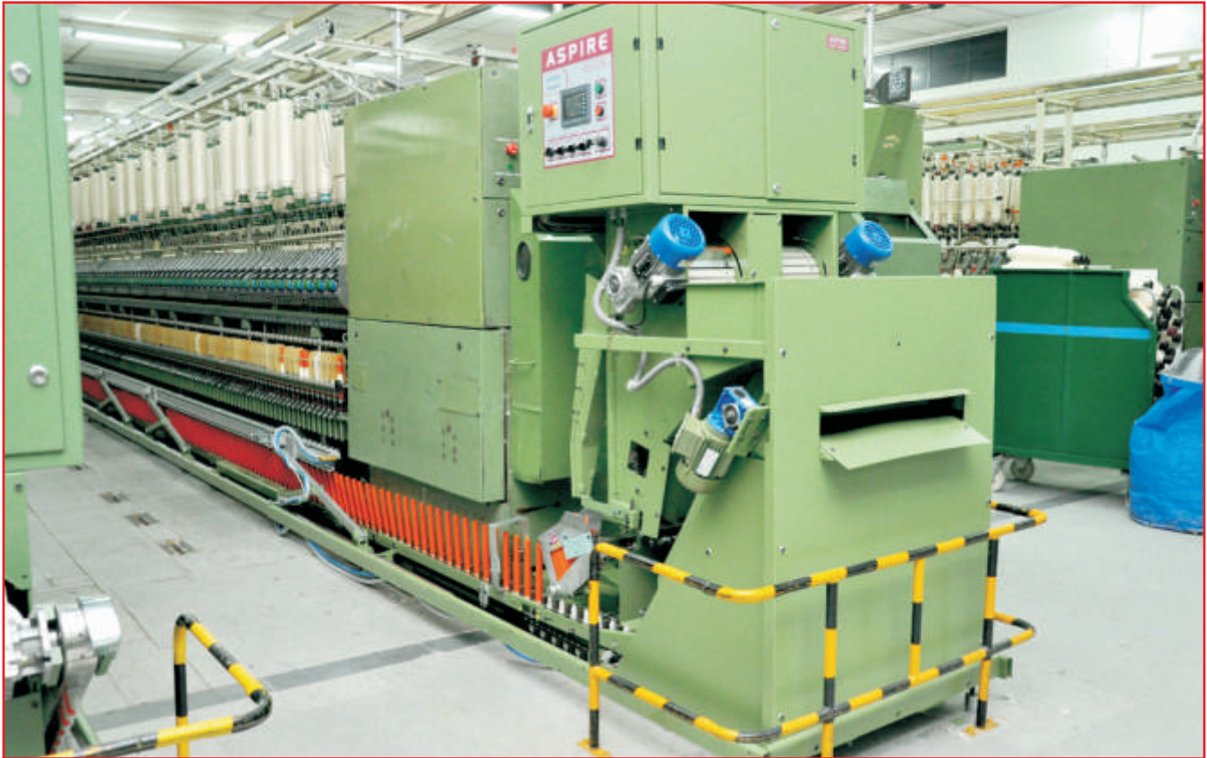
A view of the Comber Machine Aspire Model installed at our Textile Division, Sri Ramco Spinners, Rajapalayam.